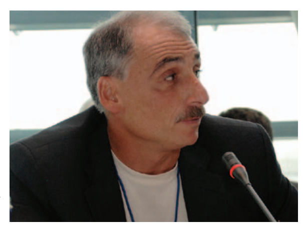
Daytona Beach Police Chief Michael Chitwood

There are a few states using familial DNA testing and it's currently used in the United Kingdom. I think we need to take full advantage of the science that we have at our disposal. If familial DNA can help us solve a rape or murder case promptly,